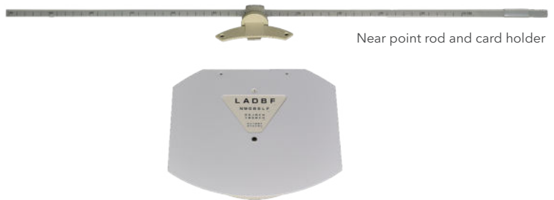
Near point rod and card holder